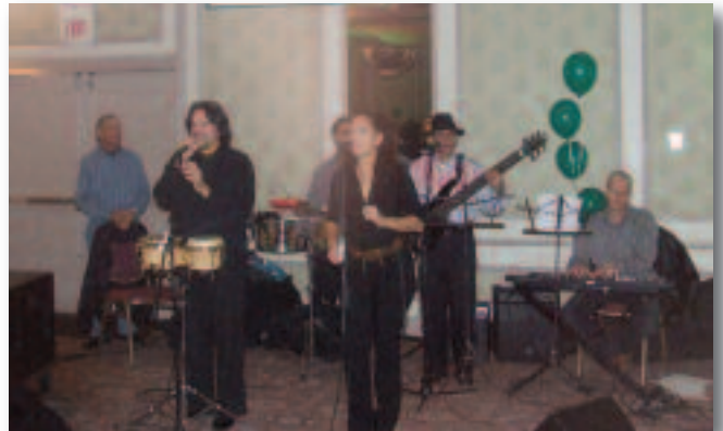
Entertainment at the Reception was provided by Salsa band, Havana Nights Express