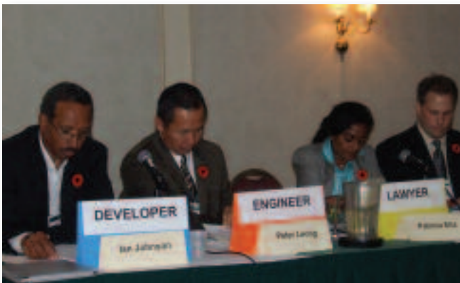
Panelists of the Tarion Session prepare for their session.

Mark your calendars now for next years’ conference taking place on Friday October 31 st and Saturday November 1 st 2008 . The conference is moving next year to enable us to enlarge our trade show and to accommodate our increasing attendance. The new venue is at the Hilton Markham Embassy Suites Hotel at Hwy #7 and Warden Ave. The format will also change to enable those with kids to partake in the Hallowe’en fun at home. See you there. ■