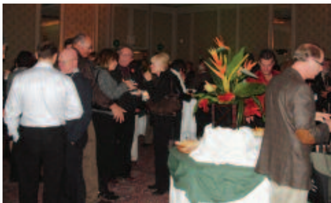
The reception was well attended and offered a casual networking forum for delegates and trades.