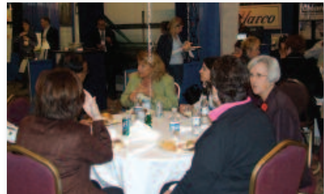
More lunchtime networking!