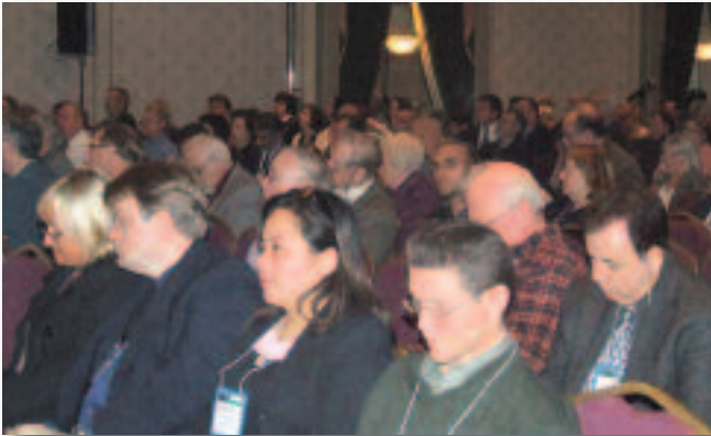
Session rooms were packed with delegates learning tips on Going Green.