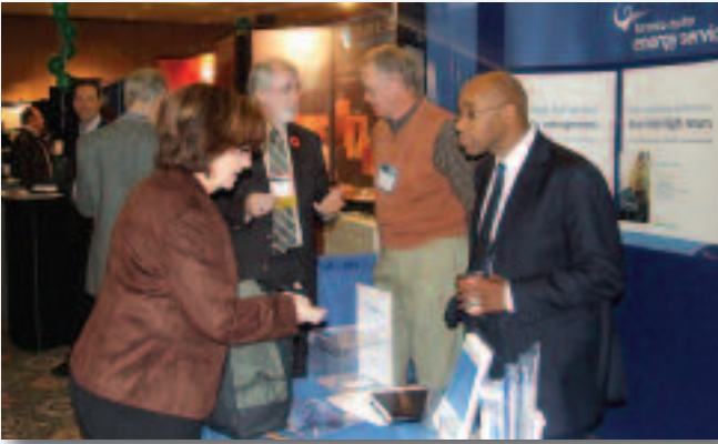
The sold out trade show offered information on the latest products and services available to the industry.