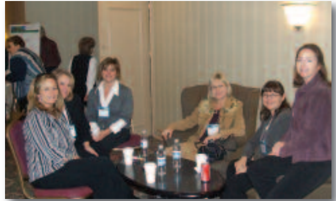
Conference Delegates are offered numerous networking opportunities.